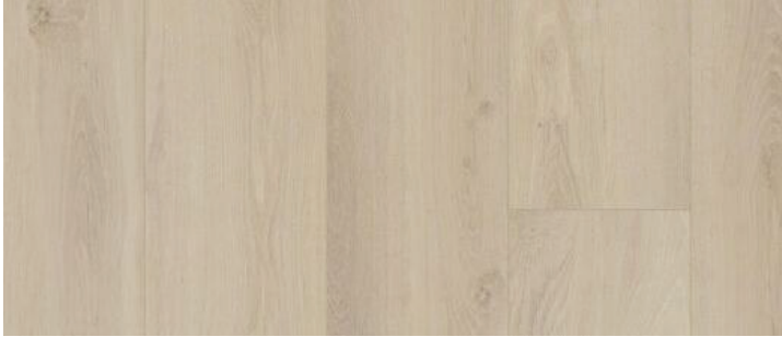
bloom sand natural