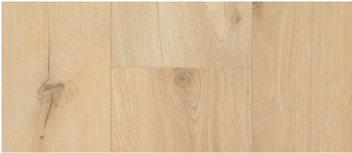
gyant sand natural