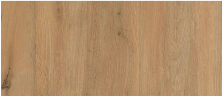
gyant warm natural