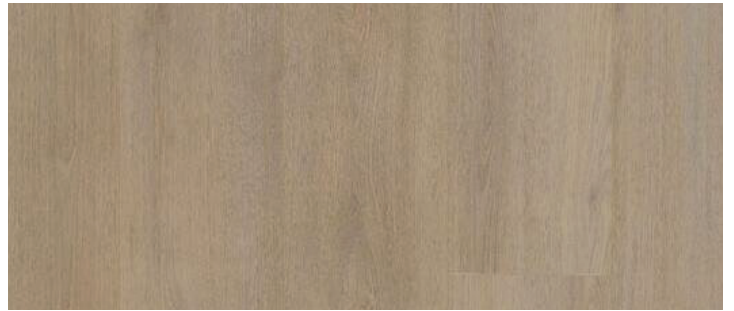
select light brown