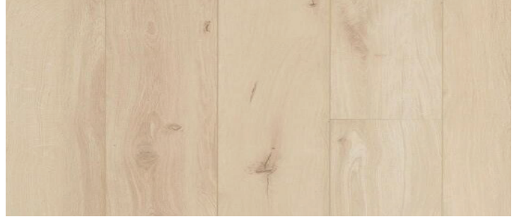
gyant light sand