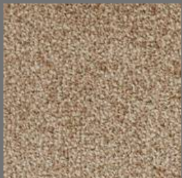
LIGHT BROWN 91