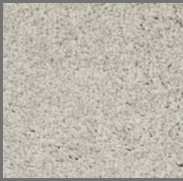
SILVER WHITE 61