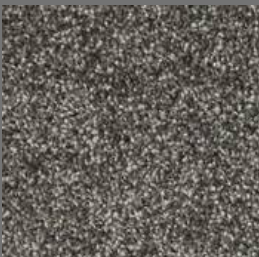
MEDIUM GREY 71