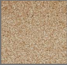
DARK CREAM 93