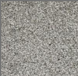
LIGHT GREY 75