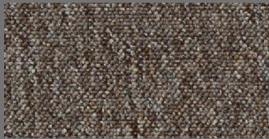
HUDSON SQUARE 92