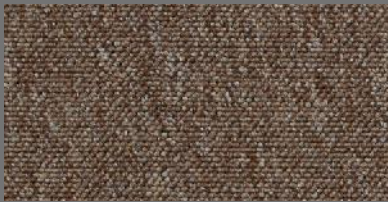
LENOX HILLS 91